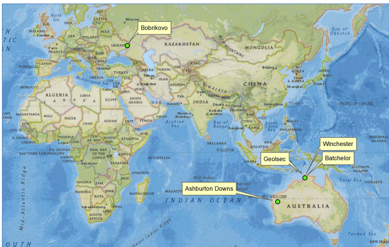
Figure 1 Location of Company's projects

The Bobrikovo gold and silver mine which is located in eastern Ukraine, is currently on care and maintenance while Korab has engaged with various stakeholders with the view to recommencing operations.